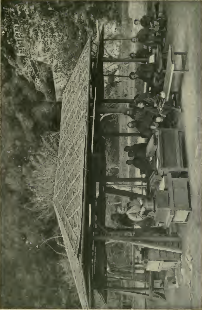
WAYSIDE RESTING PLACE.